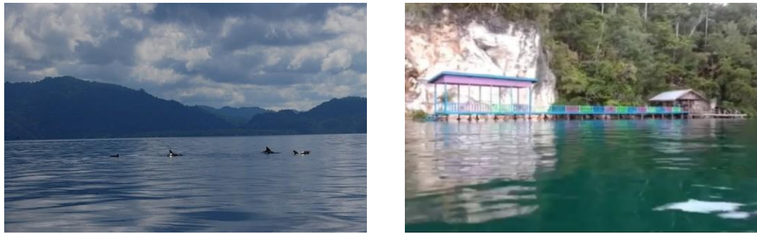
Fig. 8. A pod of dolphins in Kabui Bay.