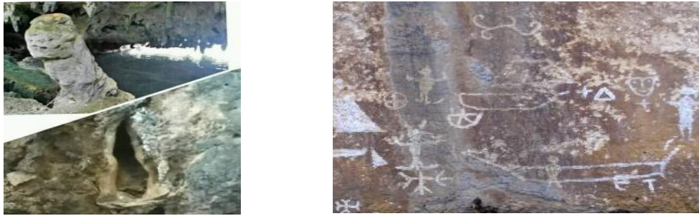
Fig. 6. Sex cave and mural of Waiganyom and Gaman