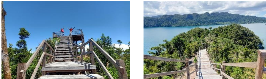
Fig. 4. Marindal Peak, Kabui Bay

Puncak Marindal is a new tourist attraction developed in 2017 by the customary owner, A.M. (Fig. 4), which is a trek to the top of a karst. Tourists must pass several steps to reach the top, around 230. At the top of the kars are two viewing platforms with views to the west of Kabui Bay in the form of calm waters with many kars. At several stops along the way up the stairs, there are views towards Wawiyai village. Tourists can rest and have lunch on the spacious, comfortable jetty where the boat or speed is docked. At certain times, if requested, local arts played by the children of Wawiyai village can be performed.