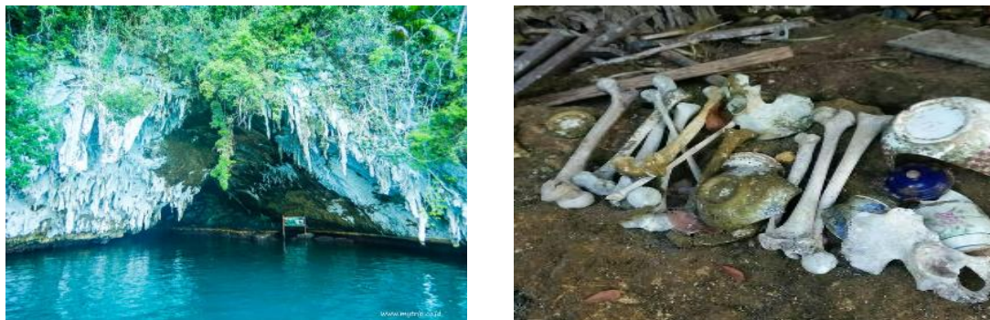
Fig. 5. Wawiyai Cave, Skull Cave

Several caves are found in the rock cliffs along Kabui Bay on the Waigeo Island side, one of which is the signposted Wawiyai Cave, which smells of bat droppings. The condition of the cave is unique because the existence of the cave mouth is very dependent on the ebb and flow of seawater. If tourists like cave tours, it is exciting to try to stop at the Wawiyai cave because it can be an alternative spot that can be visited. However, the Wawiyai Cave spot generally looks less attractive to tourists (Fig. 5).