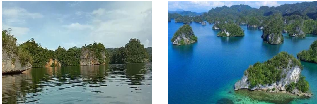
Fig. 6. A cluster of karsts that form a giant maze

Kabui Bay is extensive, from its entrance on the East side near Yenbeser Village on Gam Island until it ends before entering the narrow strait between Waigeo Island and Gam Island). Along this area, there are so many small karst islands of various shapes that it becomes a unique attraction for tourists in Kabui Bay that will confuse tourists in the middle of the collection of karsts.