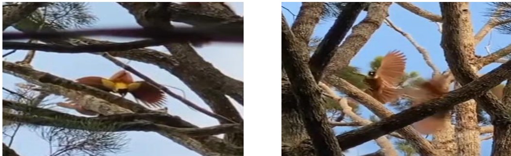
Fig. 9. Flock of Birds of Paradise playing in a tree at Kabui Bay.

The Bird of paradise observation site at Kabui Bay features an attraction of 5 to 7 birds of paradise at the same time playing on the trees that are not too high. Tourists need to trek in the morning (6-7 am) into a less dense forest as far as 300 meters to reach the tree where the birds of paradise usually play. The species of bird of paradise is the Red Cenderawasih ( Paradisaea rubra ) (Fig. 9).