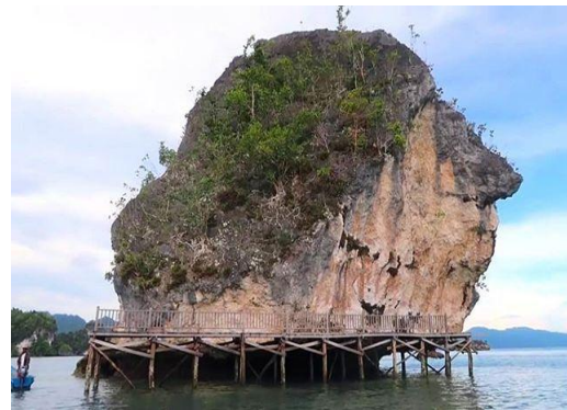
b. Batu Wajah