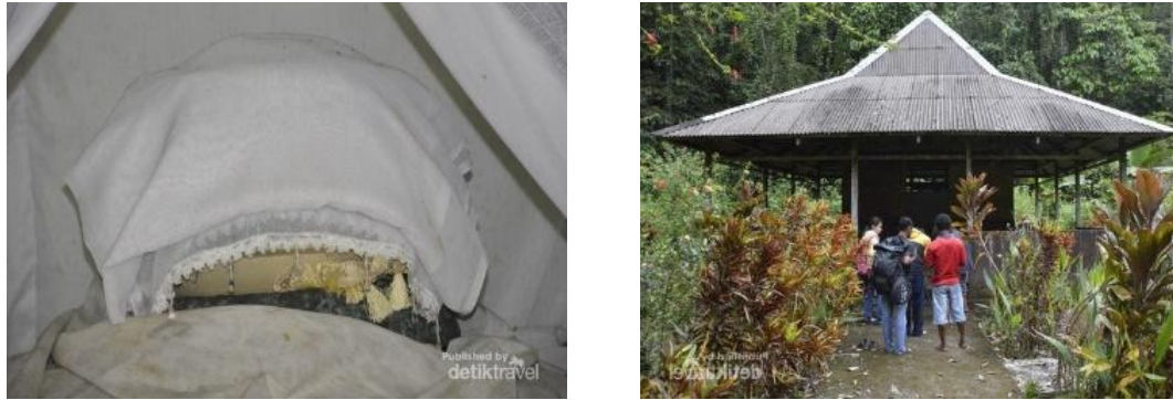
Fig. 10. King egg house at Kali Raja, Kabui Bay