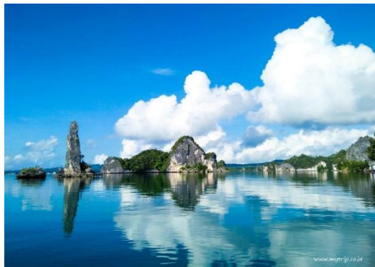
a. Pencil stone Geosite

Kabui Bay is located in the South Waigeo region, one of the four major islands in the Raja Ampat Islands of West Papua, Indonesia. The bay geographically offers relatively easy access from the district capital, making it a strategic location for tourism development. The region has calm waters, spectacular karst panoramas, and a stretch of small islands forming a mesmerizing natural landscape. Kabui Bay is a bay that is part of Waigeo Island, the largest of the 4 main islands in the Raja Ampat Islands. Kabui Bay is more accessible to reach Waisai by sea for approximately 30 minutes than by land, as the available land route must go through the forest. The waters of Kabui Bay have a depth that varies between 18 to 53 meters from the mean sea level. The average depth in the central part of the area is 35 meters deep. The entire water area of Kabui Bay is included in the administrative area of Wawiyai village (purple color bordered by a red line in Fig. 2). However, in addition to the water area, Wawiyai village has a relatively large land area still in the form of a forest (in Fig. 2, shaded light brown color).