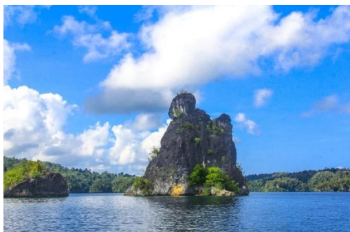
a. Batu Gendong

Not far from the pencil stone and carrying stone, there is a karst shaped like a person carrying something on the shoulder. Batu Gendong, when viewed from the side and close distance, is also similar to the Sitting Buddha Statue (Fig. 3).