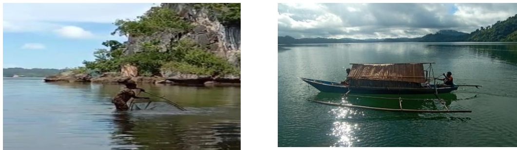
Fig. 11. Traditional life of wawiyai village community

Wawiyai Village is the only village in Kabui Bay; the villagers still live their daily lives in a traditional way. The main livelihood of the population is fishermen who still use traditional tools to catch fish or other marine products. Some sea products are processed into shrimp paste and salted fish, known as superior salted fish because they come from clean waters and are processed very cleanly. The boats used are mostly unmotorized or still use oars (Fig.11).