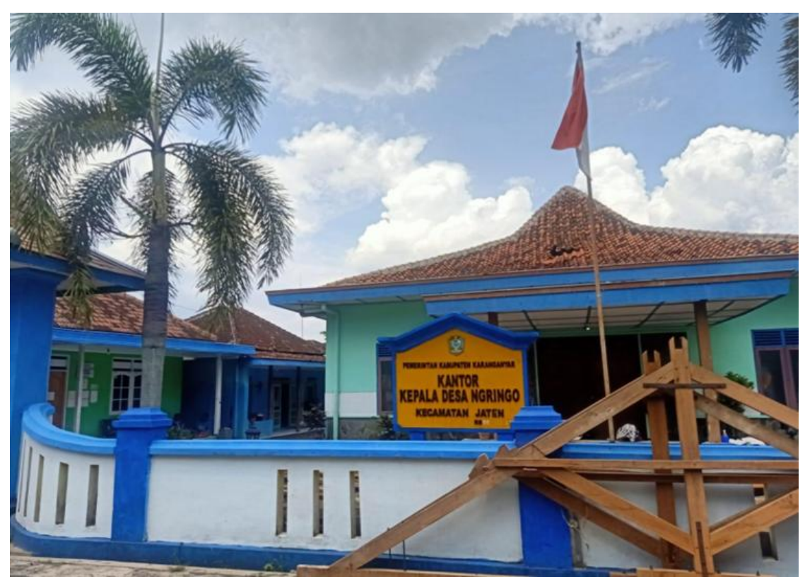
Fig. 1. Ngringo Village head office

Ngringo Village is one of the villages actively involved in rural community development. Ngringo Village is divided into eight Hamlets, namely Jurug Hamlet, Banaran Hamlet (consisting of Banaran Hamlet, Kapohan Hamlet, Jomboran Hamlet, and Daleman Hamlet), Palur Hamlet (consisting of Palur Hamlet and Ngringo Hamlet), Karangrejo Hamlet (consisting of Karangrejo Hamlet and Winong Hamlet), Puntukrejo Hamlet (consisting of Puntukrejo Hamlet, Randurejo Hamlet, Plosokerep Hamlet, and Dalon Hamlet), Gunung Wijil Hamlet (consisting of Gunung Wijil Hamlet and Nosido Hamlet), Gunung Sari Hamlet (consisting of Gunung Sari Hamlet and Benowo Hamlet), and Silamat Hamlet (consisting of Silamat Hamlet, Gerdu Hamlet, and Serut Hamlet). In carrying out its duties, Ngringo Village is led by a Village Head or Chief, assisted by a village secretary or clerk, 3 staff members, 3 technical field implementers, and 8 hamlet heads who carry out their duties at the Ngringo Village Office.