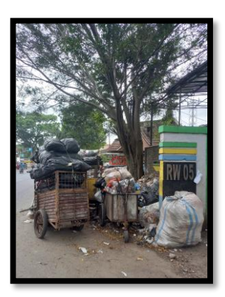
Figure 6. Piles of garbage around residential areas