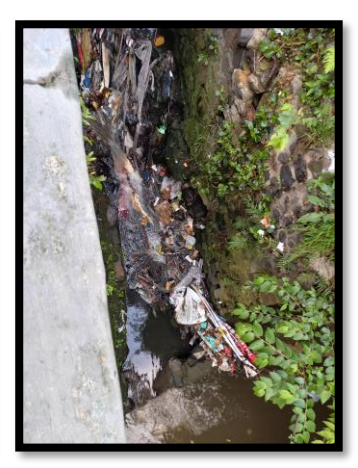
Figure 5. Sewer from residents' houses that flows directly into the Cikapundung river (The Month, 2023)

Researchers also found many piles of garbage around people's homes (figure 6). Public understanding of waste processing is still relatively low. Based on the results of interviews with the community, the separation of organic and inorganic waste is also still very rarely carried out by the surrounding community. The general public already knows that keeping the river clean is a common task. However, the community still needs to be equipped with an understanding of the importance of protecting the environment and rivers so that environmental pollution does not increase.