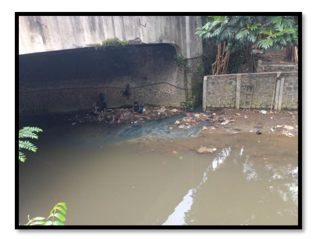
Figure 3. Water color brownish-black and shallow (Tamba, 2023)

Based on Figure 2a above as a result of observations that have been made by researchers in the Cikapundung river around Wastukencana road, researchers found a lot of inorganic and organic waste scattered in river water. In addition, researchers also found buildings (houses) on the banks of the Cikapundung river and on the roof of the house filled with garbage (Figure 2b). In my opinion, this has the potential to pollute the water of the Cikapundung river because the garbage scattered around the river water partly comes from the roofs of people's houses on the banks of the river. If this is left continuously it can result in a buildup of garbage that will be carried away by water so that it has the potential to flood.