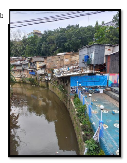
Figure 2. (a) Cikapundung river bank; (b) Houses located on the banks of the Cikapundung river

Based on Figure 2a above as a result of observations that have been made by researchers in the Cikapundung river around Wastukencana road, researchers found a lot of inorganic and organic waste scattered in river water. In addition, researchers also found buildings (houses) on the banks of the Cikapundung river and on the roof of the house filled with garbage (Figure 2b). In my opinion, this has the potential to pollute the water of the Cikapundung river because the garbage scattered around the river water partly comes from the roofs of people's houses on the banks of the river. If this is left continuously it can result in a buildup of garbage that will be carried away by water so that it has the potential to flood.