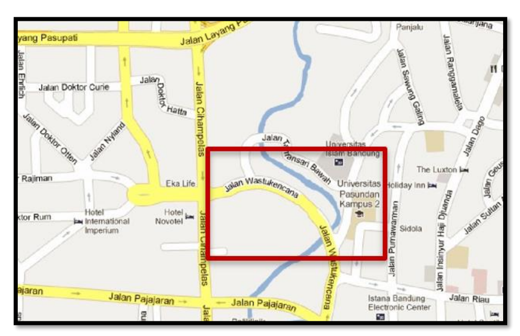
Figure 1. Research location